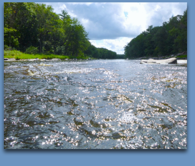
Our Mission Statement: Celebrating and Stewarding the