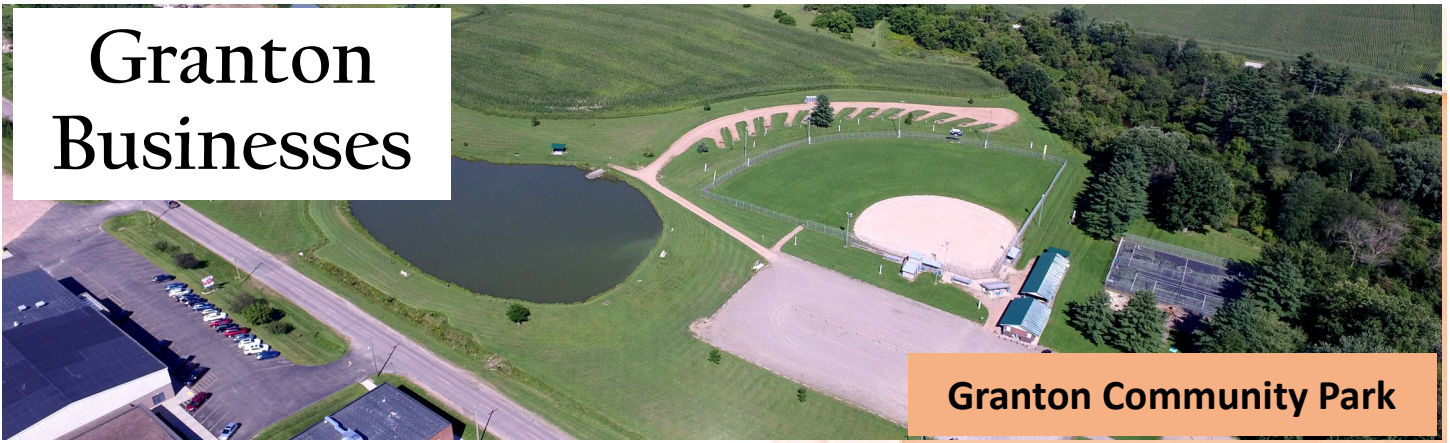
Granton Community Park