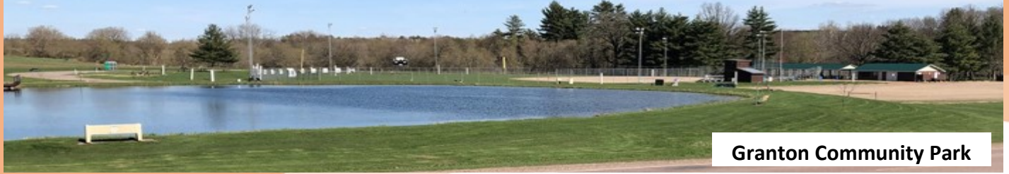
Granton Community Park