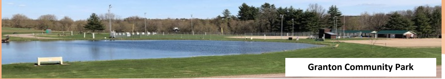
Granton Community Park