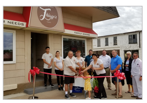
Thiago's Café (celebrated new ownership of the long-time Amber's Café), Colby