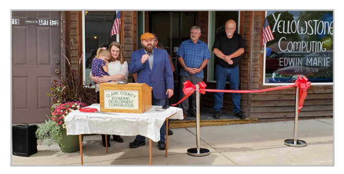
Yellowstone Computing, Thorp