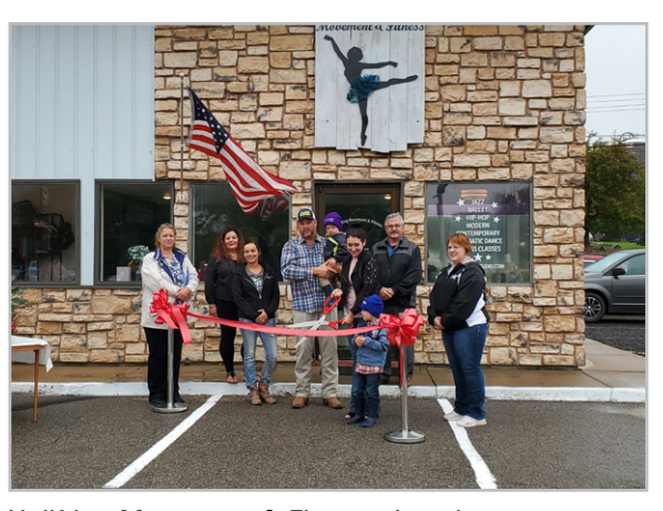
Uplifting Movement & Fitness, Loyal