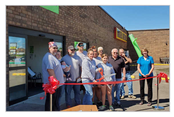
Great Deals LLC, Abbotsford