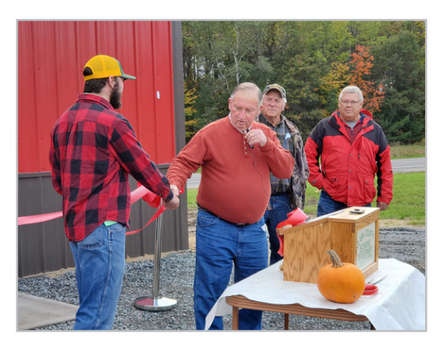
Perfect 10 Outdoors, Town of Hewett