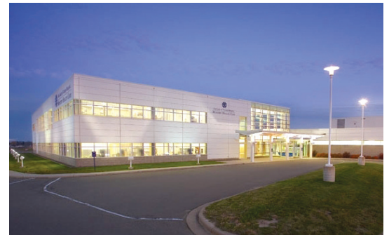
MINISTRY OLV HOSPITAL

City of Stanley 353 S. Broadway St. P.O. Box 155 Stanley, WI 54768 715-644-5758 www.stanleywisconsin.us