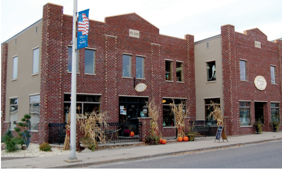
BROADWAY HOME DECOR AND FLORAL